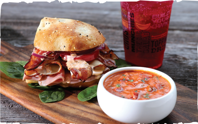
SOUP* + SANDWICH $10