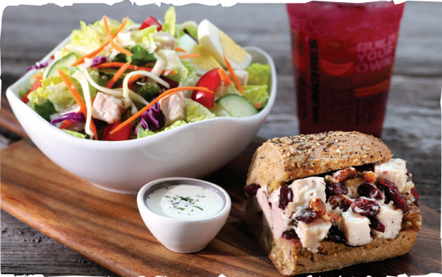
SALAD + SANDWICH $12