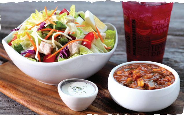
SALAD + SOUP* $11